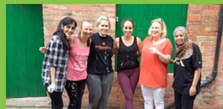
Pictured: The Programme Management Team from Boots brightening up our waiting room.

It was a great team challenge to improve the surroundings our families so often use. Their hard work has really made a difference and we'd like to say a big thank you to them.