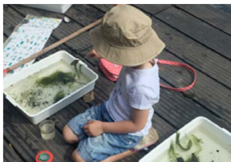
Pictured: Examining the findings from the pond.