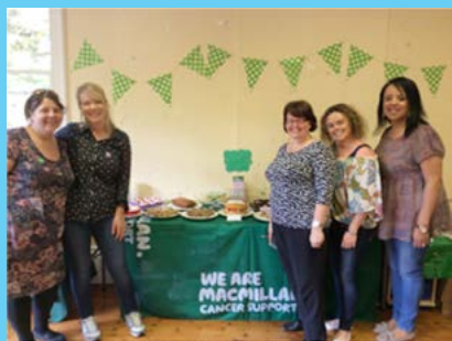
Spiral team members setting up for the morning.

Spiral hosted our first Macmillan Coffee Morning in September with a great contribution of cakes, raising £162.01 for Macmillan Cancer Support. A big thank you to everyone who supported the event, carers, staff, trustees, and new partnerships.